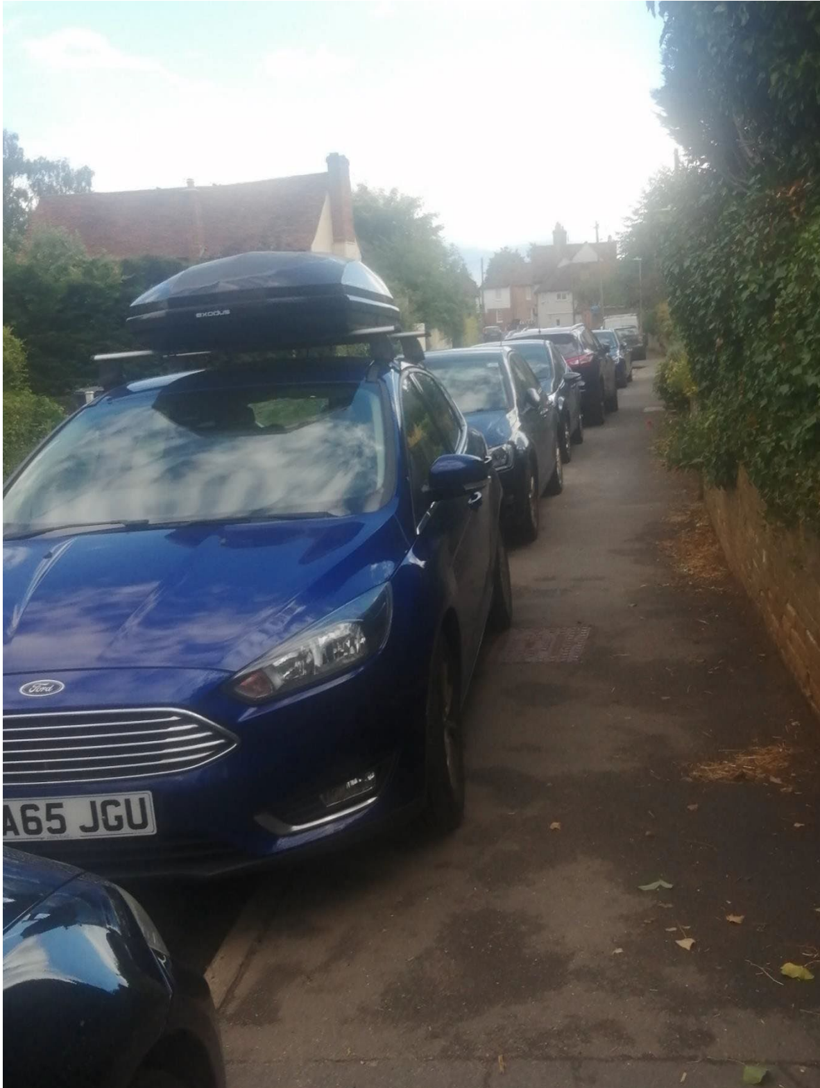
KP/3 – LH Albury Road (from Albury towards Hadham lights) – verges of the roads filling up, Saturday 6 th July at 17:47. Objective – public safety & public nuisance.