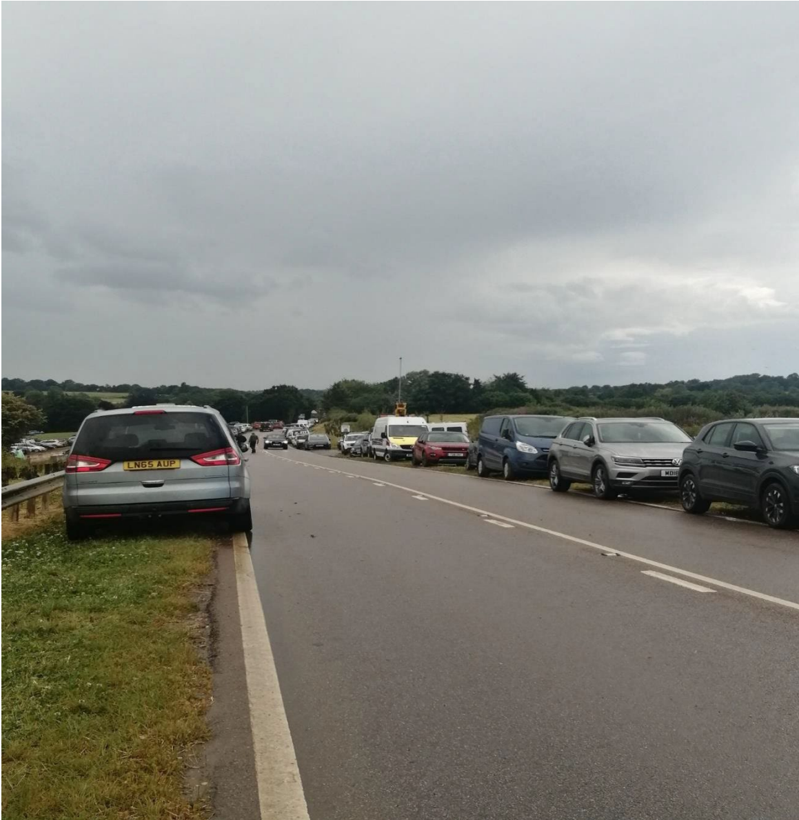
KP/8 – LH Albury Road bridge (between Albury and LH) – verges of the roads filling up again, on Sunday 7 th July, 13:18 following the previous day/night road traffic accident. Objective – public safety