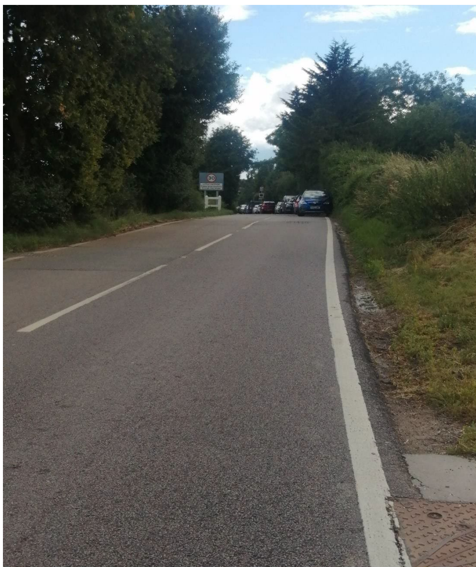
KP/1 – LH entrance to Albury Road (from Albury) – both verges of the road filling up, Saturday 6 th July at 17:39. Objective – public safety

See Photos KP/1, KP/2, KP/3, KP/4, KP/7, KP/8, KP/9, KP/10, KP/11