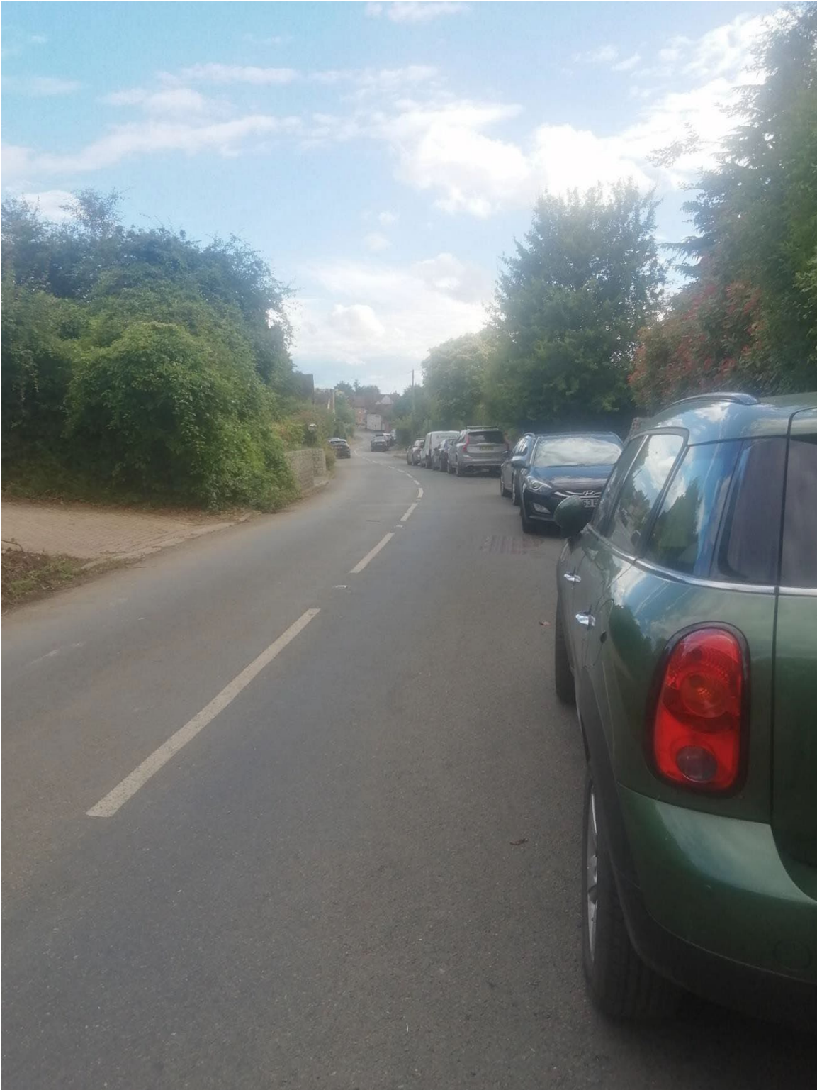
KP/2 – LH Albury Road (from Albury towards Hadham lights) – verges of the roads filling up, Saturday 6 th July at 17:46. Objective – public safety